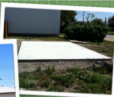
Summer Bloom and Building Projects at The Roulston Museum