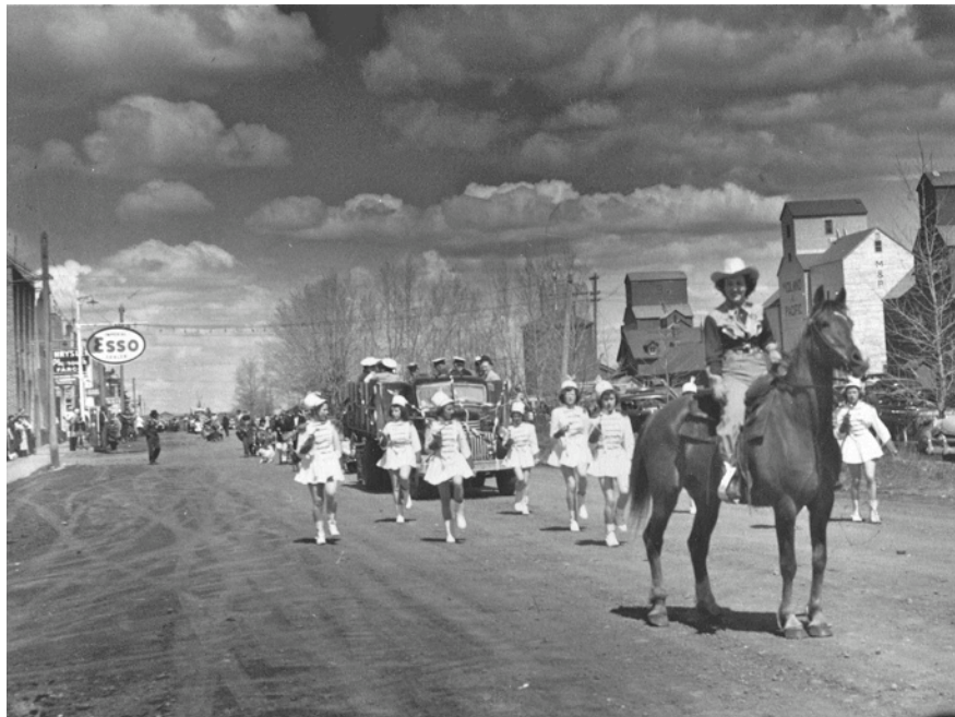
Nothing like a Summer Parade! Can you correctly identify the year of this photo? Who is in the lead?